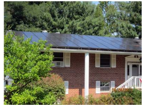
Solar panels on the roof of the home of Chuck Lynd and Sheila Fox.

Prepping. No, we weren't prepping for the apocalypse, but we heeded the advice of solar