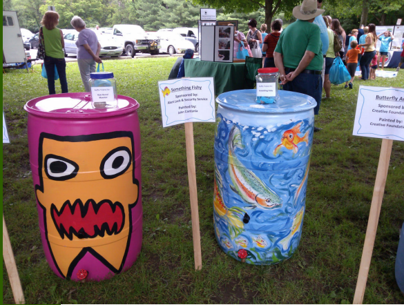
Last year, 13 barrels were sponsored, resulting in over $500 raised for the Olen-

tangy Watershed Alliance to support projects in the Upper Olentangy Watershed.